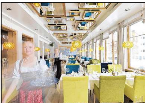
GREAT FOOD: The restaurant at the Wiesenhof in Austria

Some 44% of British parents claimed government spending cuts would impact their travel plans this year.