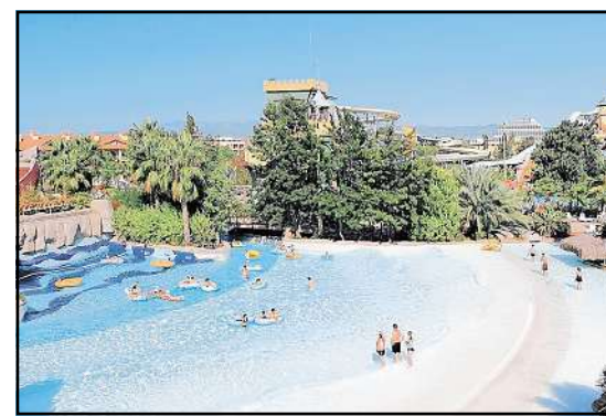
SO MUCH TO DO: The Aquapark

Our stay there was a tonic and we came away feeling rested yet revived. Must be all that silence.